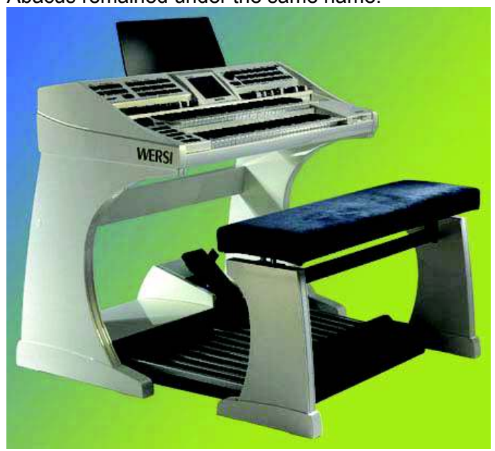
The Wersi Da Vinci OAS Prototype – notice the lack of speakers, different touch screen housing and also extra detailing on the cabinet.

The Open Art-System was conceived in the late 1990's by the Wersi Company. Rumours started around 1999 about a new generation of instruments that were being produced by the German manufacturer. Sure enough in 1999, the prototypes were being constructed. The first prototype instruments were the "Da Vinci" & "Abacus". The Da Vinci eventually became the Scala and the Abacus remained under the same name.