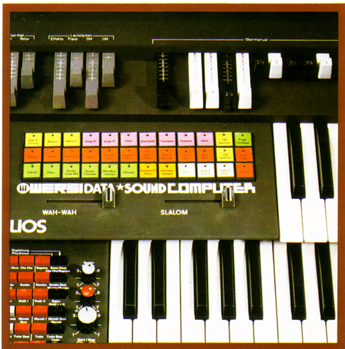
The control panel of the SOUND COMPUTER with easy-to-operate push buttons and LED indicators.