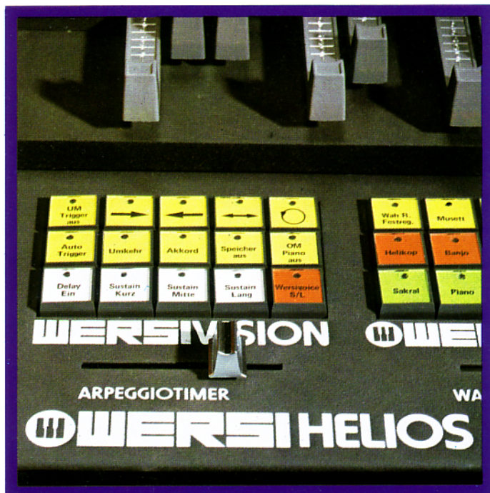
WERSIHARP control panel

WERSI introduces a novelty which reaches into a futuristic era of sounds.