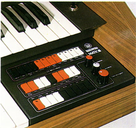
WERSIMATIC III, the new rhythm and auto accompaniment of the COSMOS.