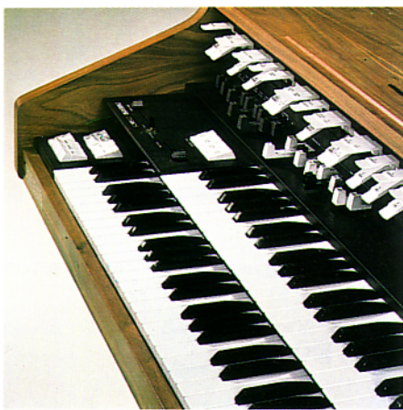
View onto the keyboards of the COSMOS.