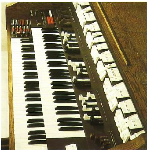
A glance at the Playing Table of the ZENITH.

Many music lovers look for an organ on which they can play entertainment type music as well as works of the classical and liturgical realm. The WERSI organ ZENITH W3 S fills these requirements.