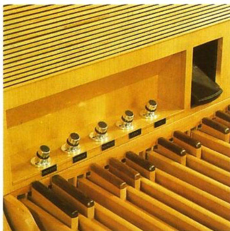
Foot-actuated Combination Action.

It might interest the church organist to know the formant filters for the fixed stops can be optionally equipped with connectors. By replacing certain registers he can create new dispositions. The CLASSICA is further marked by its couplers and electronic Combination Action.