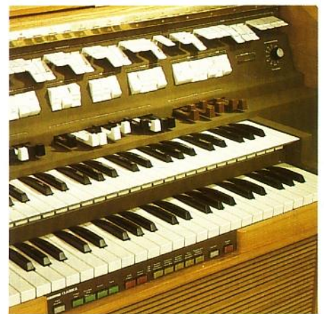
Couplers and Combination Action at your finger tips.