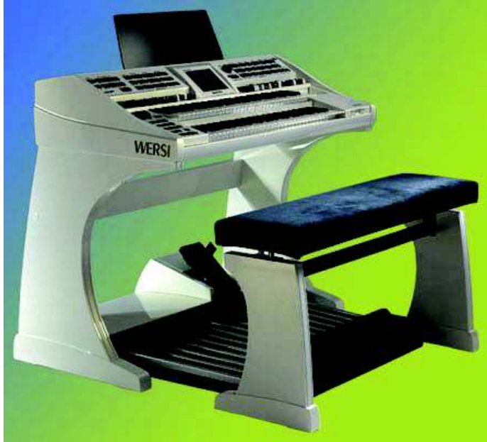
The Wersi Da Vinci OAS Prototype – notice the lack of speakers, different touch screen housing and also extra detailing on the cabinet.

The Open Art-System was conceived in the late 1990's by the Wersi Company. Rumours started around 1999 about a new generation of instruments that were being produced by the German manufacturer. Sure enough in 1999, the prototypes were being constructed. The first prototype instruments were the "Da Vinci" & "Abacus". The Da Vinci eventually became the Scala and the Abacus remained under the same name.