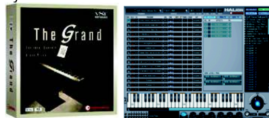
(Above Left) The Grand VST from Steinberg (Above Right) Steinberg Halion VST screen shot.

With OAS 7, Wersi has succeeded in integrating a complete VST host into the Open Art-System. A VST is a “Virtual instrument” program used in professional studios within a Cubase sequencer environment. Basically what this means is that many music producers like to use the sounds which come in the VST and use them in their music productions. The VST instruments such as “The Grand” from Steinberg sound absolutely fantastic and is one of the most detailed Grand Piano sounds on the market. With VST integration, Wersi have allowed these VST instruments to be played live and completely within the OAS system like a normal factory sound. 4 VST instruments can be loaded and used at the same time. Like the other new sounds, the VST instruments can be used for sequences, styles and in conjunction with any of the other sounds that are available in the OAS system